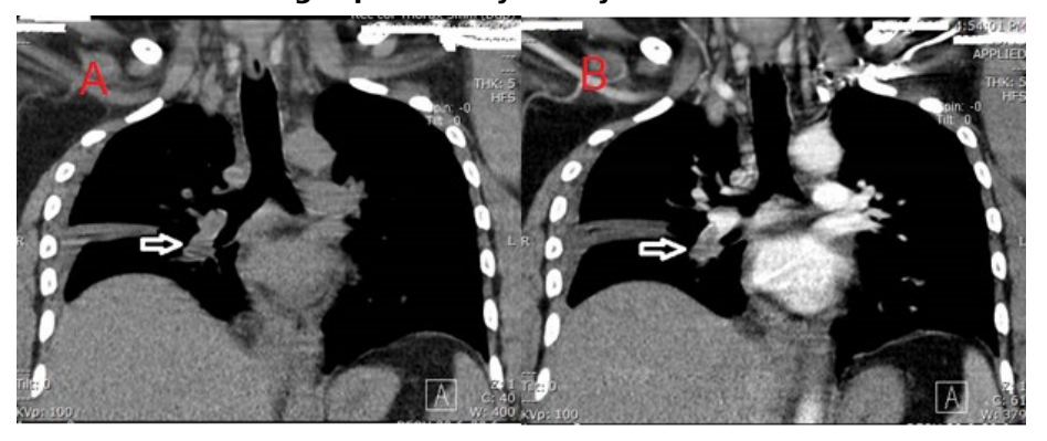
IMAGE 2. A, 5 mm coronal reconstruction of the simple study, the right lower lobar artery is indicated, note the thickening of the minor fissure. Artery phase B image showing the thrombus in the lower lobar branch of the right pulmonary artery

condensation of the posterior and lateral segment of the right lower lobe ( image 2 A and B , image 3 A and B ).