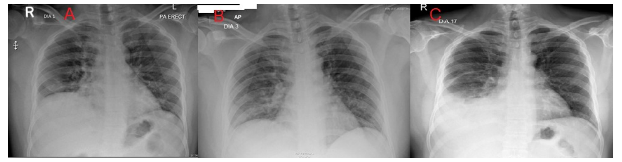
IMAGE 1. The three AP chest radiographs corresponding to days 1 (A), 3 (B) and 17 (C) are shown, note the progressive worsening

On day 14 of admission, CT angiography of lung was performed, due to the clinical suspicion of PTE; a thrombus was demonstrated in the right lower basal pulmonary artery, right pleural effusion, and partial